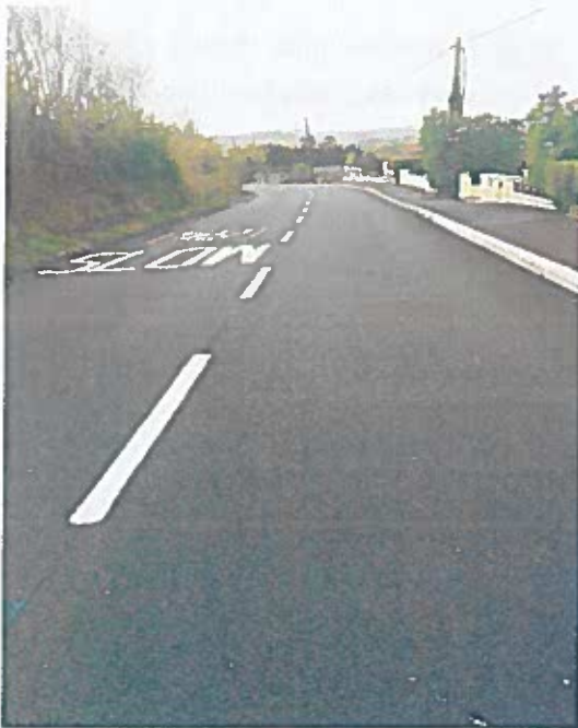
Photo of the Yellow Road, newly resurfaced with footpath reconstructed under the 2016 RWS